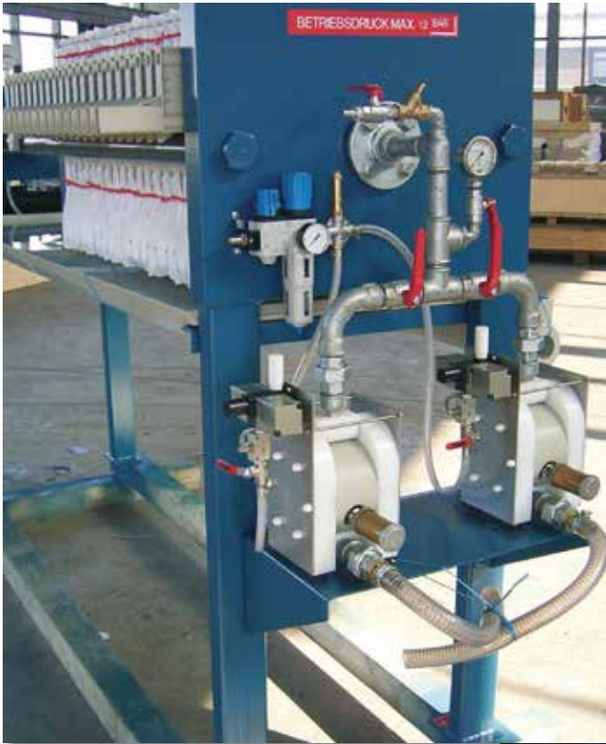
◀ Compact TF filterpress pumps installed for recovering solid waste from water