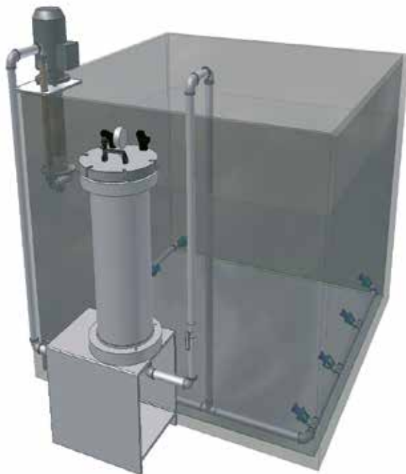
Filtering and agitation Standalone FT filter installed in series with CTV vertical pump and agitation nozzles. The CTV pump is strong and insensitive, making it ideal for installations in pre-treatment baths where particles are present.