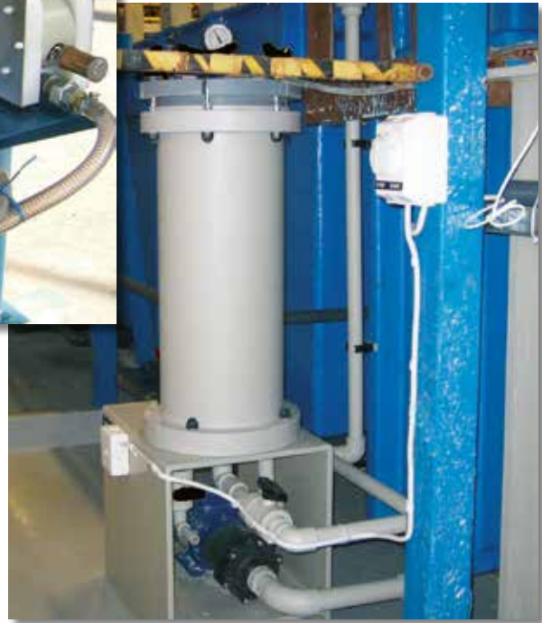
Filter FT and magdrive pump CTM used ▶ for circulation and filtering of surface treatment bath